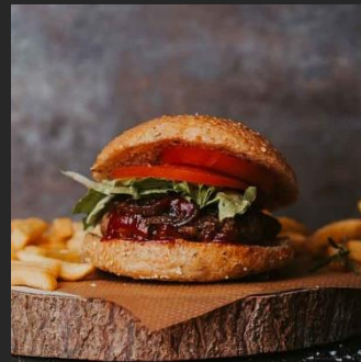
Burger Choice of 4

Bruschetta mix, scampis d'été, Mini Tranche Riesling & Bâtons orientale.