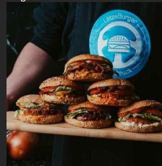
Burger of your choice

Your guests can choose a burger from our entire menu