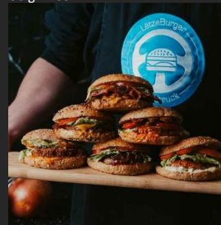
Burger of your choice

Hamburger, CheeseBurger, Veggieburger, Chickenburger