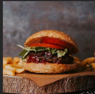
Burger Choice of 4

Hamburger, CheeseBurger, Veggieburger, Chickenburger