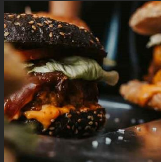
Black Angus Beef

Hamburger ,CheeseBurger , Veggie-Burger Chicken Burger