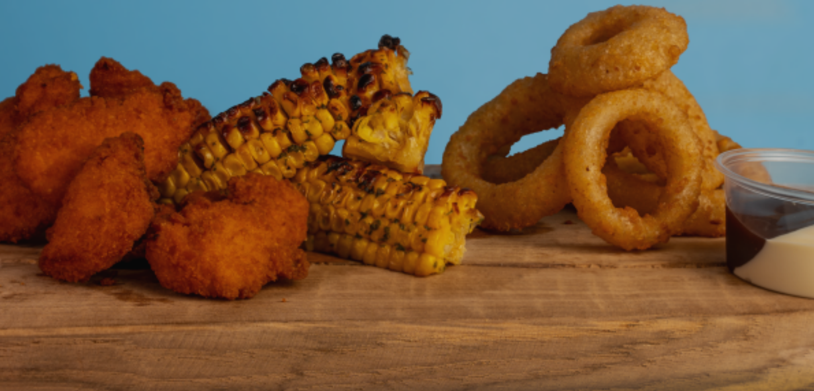
Chicken Nuggets, Onion Rings, Chili Cheese Fries, Loaded Fries Mexican Style & Pulled Pork