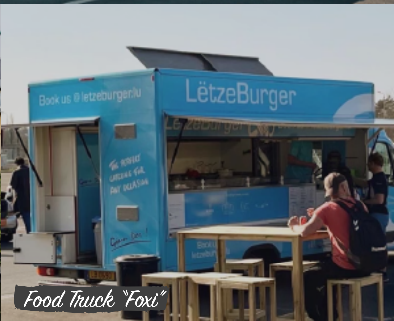
Food Truck "Foxi"