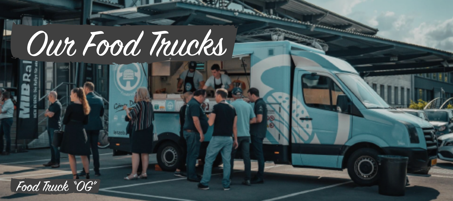
Food Truck "OG"