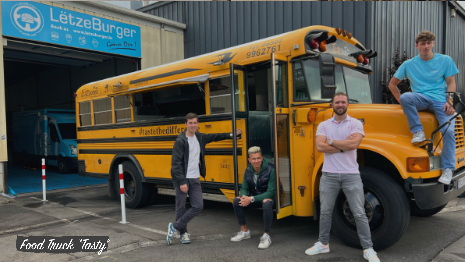
Food Truck "Tasty"