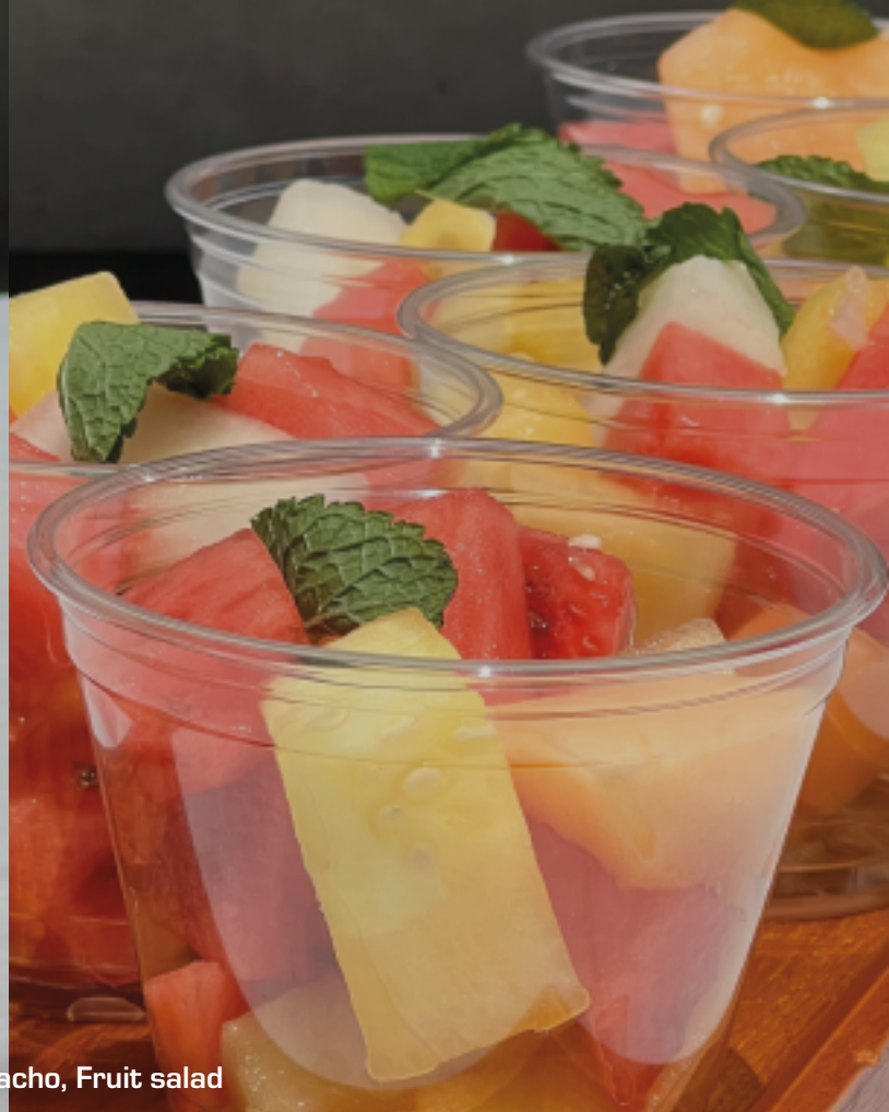
Fried chicken, Ham & melon skewer (summer special), Gaspacho, Fruit salad